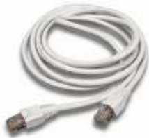
1 Network Cable