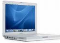
8 Apple iBook Laptop Computers