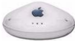
1 AirPort Base Station