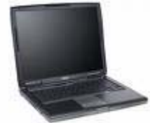
10 Dell D520 Laptop Computers